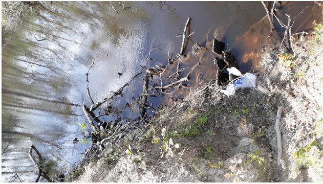
What is left of the Old Stone Grist Mill on the Stone Mill Creek, near the Bridge Crossing.